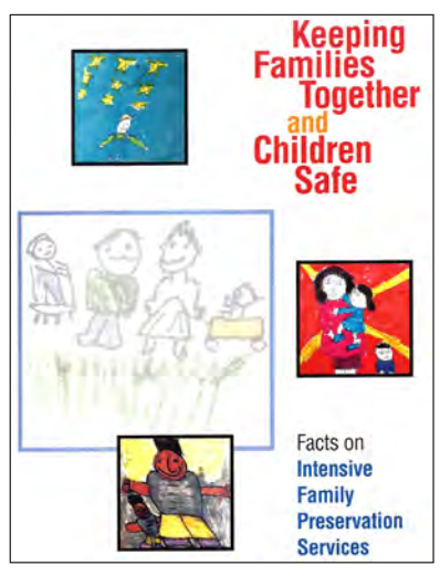
1994 IFPS Information Packet

An information packet on IFPS in 1994 provided a detailed overview of IFPS with the following components and a sample quote from each. Note that all of these components are still as essential today as they were 20 years ago: